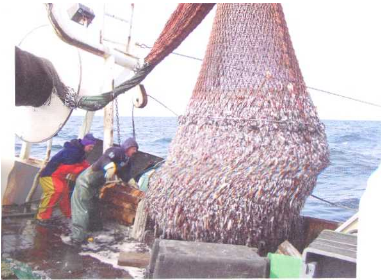
Photo 2. Rutgers University and National Fisheries Institute conduct collaborative gear selectivity research to reduce discards of scup Stenotomus chrysops in the longfin inshore squid Loligo aleificus fishery

In addition, gear studies have a long history and really cannot be done without industry boats. Examples of older industry-science collaborative gear studies include the Nordmore grate in the shrimp fishery and various studies to reduce the take of marine mammals. Many of the "collaborative" studies in the past did not fully involve fishermen in all phases of the research program, treating them mainly as owners and operators of "for-hire" vessels. Gear scientists doing collaborative research today emphasize